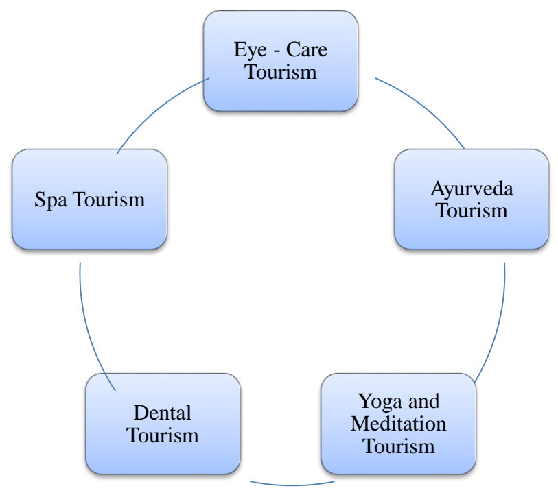
Figure 2: Components of Health Tourism